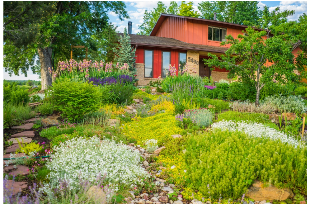
Garden In A Box landscape. Boulder, CO. Summer 2016.