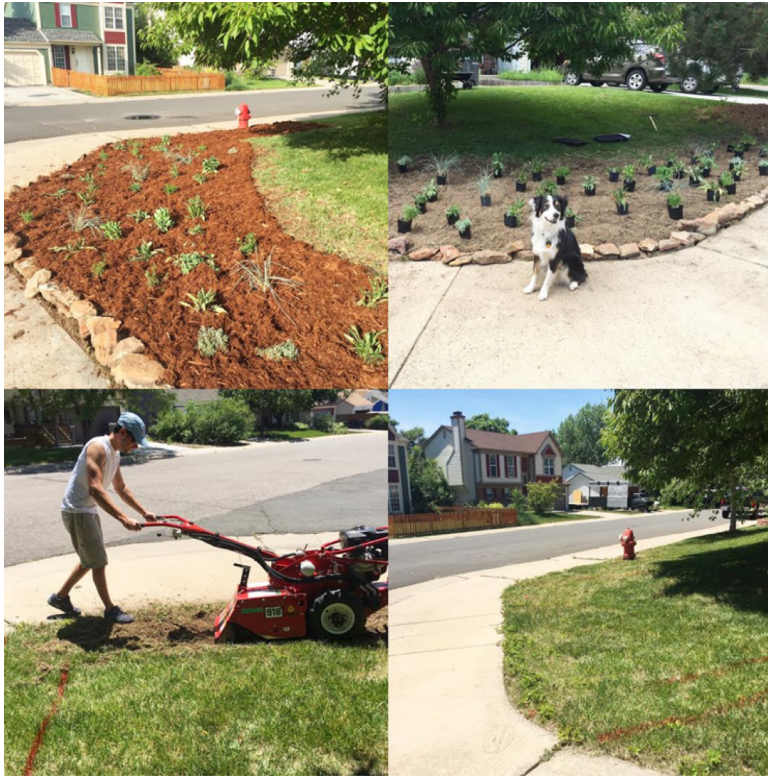
A Water-Wise Transformation with Garden In A Box!